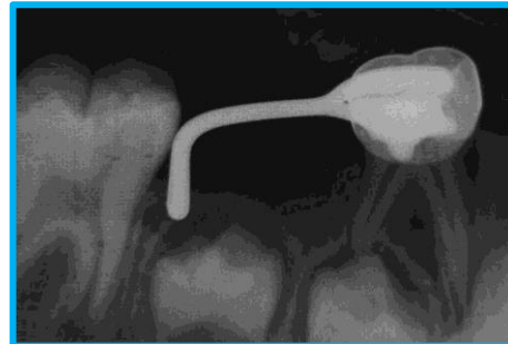
Fig. 6: IOPA radiograph

explained to the patient and informed consent was obtained after extraction under antibiotic coverage, the intra-alveolar projection of the appliance was placed in the socket so as to touch and guide the vertical eruption path of the unerupted permanent first molar on right side of the mandibular arch (Fig. 3). Intraoral periapical radiographs were taken to check the passive contact between the mesial end of the permanent first molar and the appliance before cementation (Fig. 4). The recall visits were planned after every two months to check the condition of the appliance. After 2 years the mandibular permanent first molar erupted (Fig. 5 & Fig. 6).