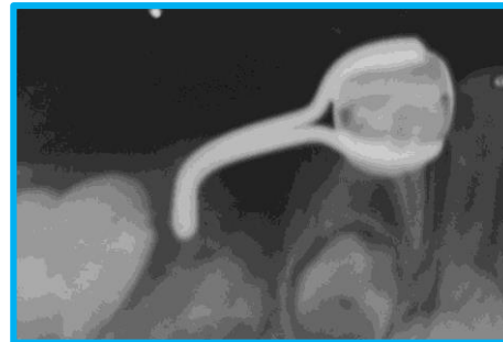
Fig. 4: IOPA radiograph