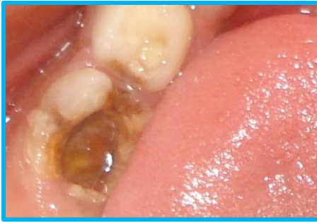
Fig. 1: Grossly carious primary mandibular right second molar