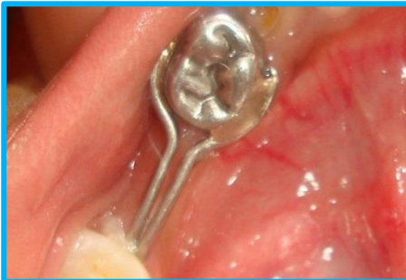
Fig. 5: 2 years showing the erupted permanent right first molar